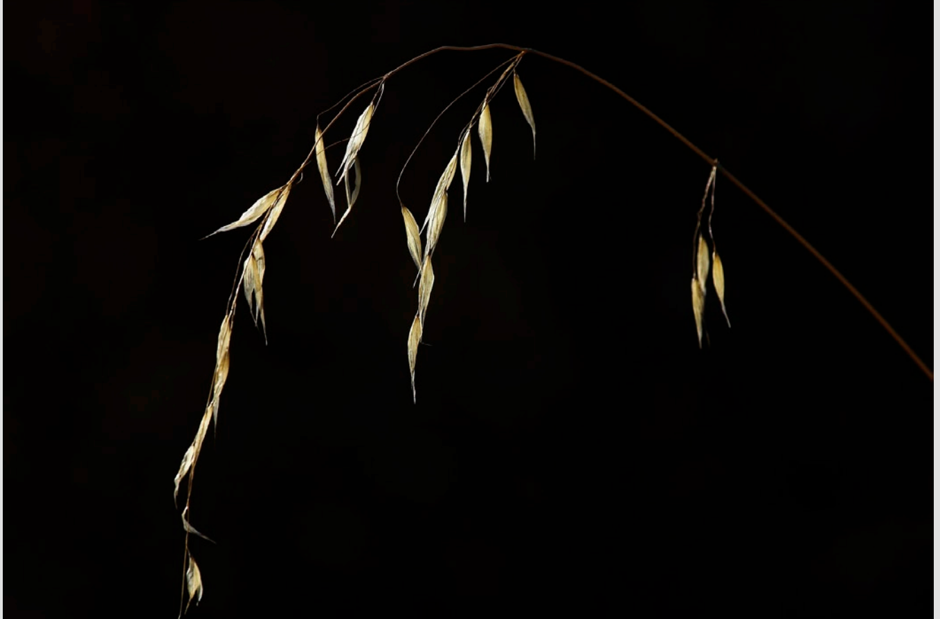
Kamera: Nikon D2X