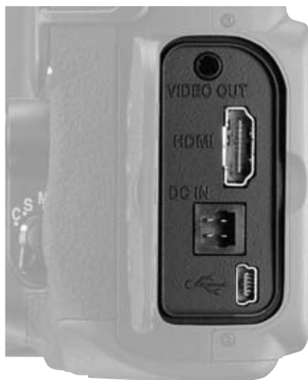
Figure 8 – HDMI Device Port

Now you can use your large screen HD TV to do a new-fashioned slide show, with old-fashioned style. So, buy some popcorn and pizza, then invite the friends over for some slide viewing fun. Be sure to take some more pictures!