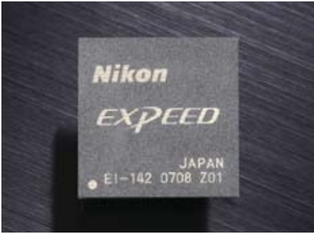
Figure 4 – Nikon D300 EXPEED Image Processor