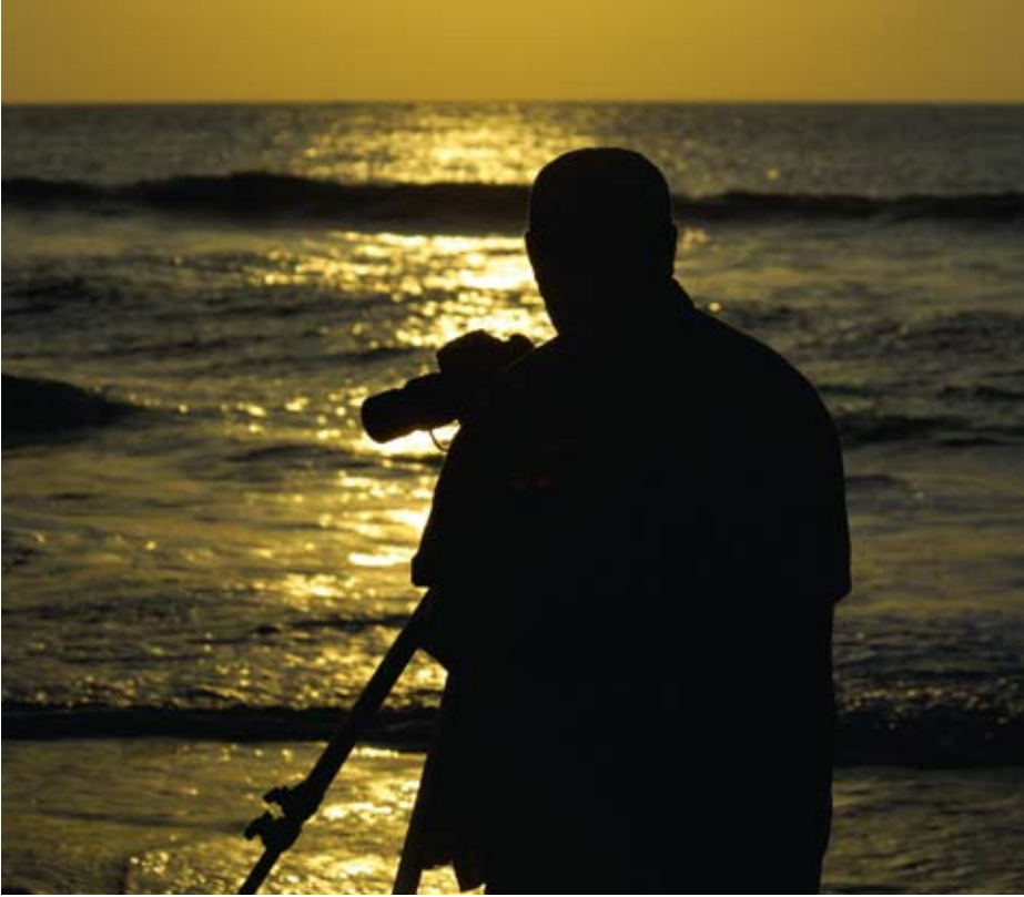
Figure 2 – Photographer Watches a Hunting Island Atlantic Ocean Sunrise

I was taking pictures that curled my eyelashes! I was walking around with this camera taking images that were so captivating, I couldn't believe what I was seeing. I was using Nikon's latest technology and my eyes to create some of the best images of my life.