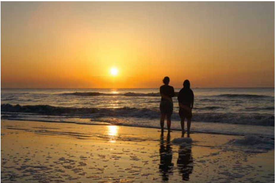
Figure 1 – Hunting Island Atlantic Ocean Sunrise

I took a few pictures and thought how smooth the shutter sounded. The images on that 3-inch monitor looked like actual pictures. I was shooting some really beautiful shots, and enjoying it. I can’t explain how exactly, but the D300 “felt different” from my D200. Something about it just felt more professional, smoother and faster. I hate to admit it, but by the end of a couple of hours of walking around with the D300, I was head over heels in love with the camera. Why? Look at this image ( Figure 1 ), for instance: