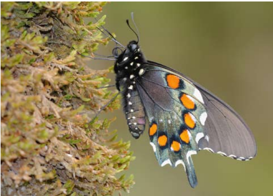
Figure 7 - Pipevine Swallowtail ( Battus philenor ) Butterfly in Macro

For this type of shot, I was able to focus in Live View very accurately, and I think I'll find other ways to use it.