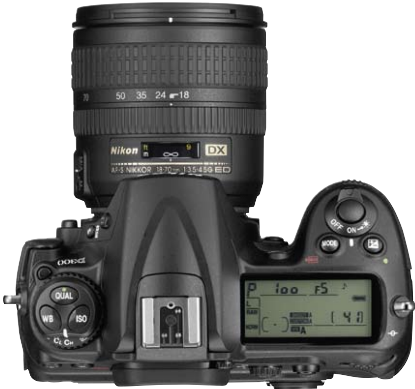
Figure 3 – Nikon D300 Top View with Nikkor 18-70mm f/3.5-4.5G Lens

Instead of simply reviewing the D300, I'd like to discuss only the new things I've found. These things are interesting for people who enjoy camera technology. Figure 3 shows my favorite view of a D300.