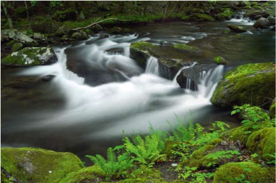
Figure 6 – Spring in Tremont, Great Smoky Mountains National Park, Tennessee, USA at 100 ISO

If you have an 8 or 16 gigabyte (or higher) compact flash memory card, you can hold hundreds or even thousands of images on one card. The D300 is plenty fast, and your card will hold the results. Try it out for yourself.